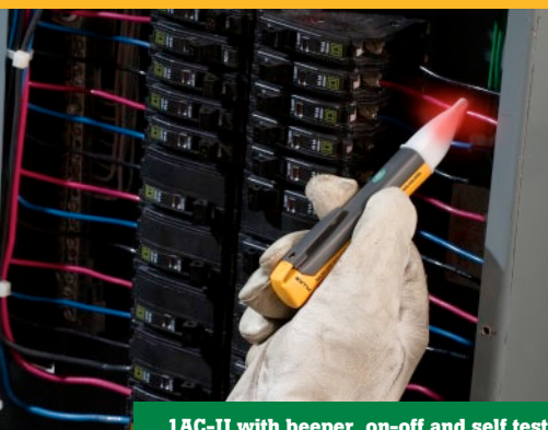
1AC-II with beeper, on-off and self test