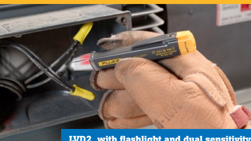
LVD2, with flashlight and dual sensitivity